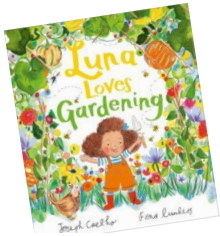
Luna loves... By Joseph Coelho To be honest, anything in this series is just lovely and fun and relateable for YR.

Here are some suggestions for good ones to enjoy with our various age groups. You can loan these from us and if you click on the picture, you'll find a hyperlink to amazon too.