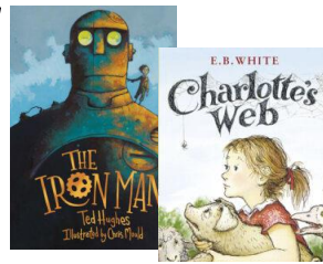
The Iron Giant by Ted Hughes Charlotte's web by EH White Year 3 can access classic 'heritage' texts as their reading becomes fluent and their understanding of the world greater. These two are brill!