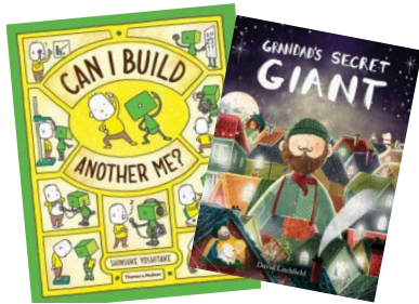
Can I build another me Grandpa's secret giant Year 1 & 2 are spoilt for choice at the moment but these two are heartwarming and about everyone's uniqueness as well as friendship against the odds.