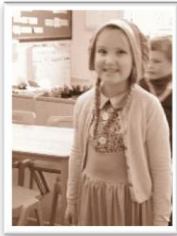
2017-18 images from their Victorian day

Years 1, 2 & 3 have the topic of 'Chalk & Cheese' all about life in Victorian times and I know many of you are already being interviewed or helping collect information from your wider family about what school was like in the past. The children will take it one step further on Wed 2 nd Dec when they come in and find school has mysteriously changed to Victorian times – full period costume is required. There is a letter with further details attached to this newsletter.