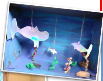
Horsebridge home learning takes all forms!