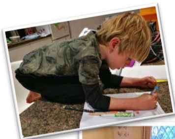
We can work anywhere!